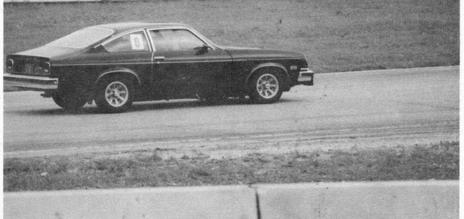
Cosworths at Road America parade lap.